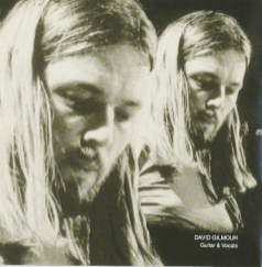
DAVID GILMOUR Guitar & Vocals